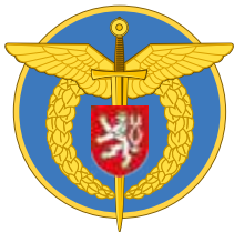
CZECH AIR FORCE COMMAND