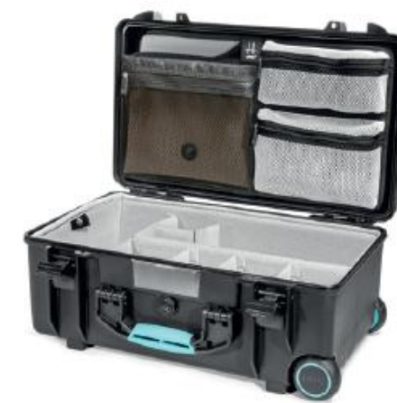
4 SECOND SKIN & LID ORGANIZER | PRO