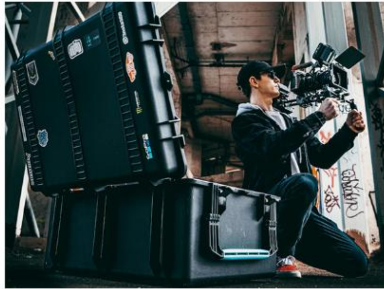
Imaging | Broadcasting