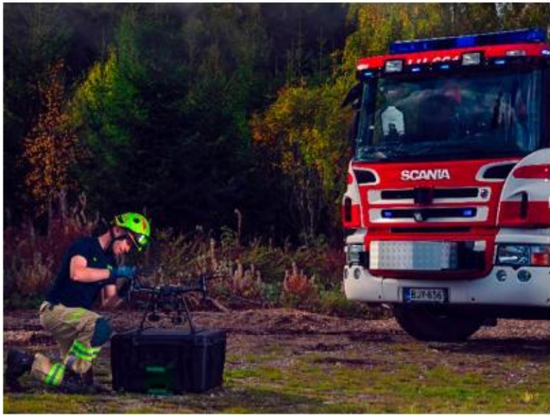
Medical | Firefighter | Emergency

Our know-how and expertise allow us to meet any customers' requirement, either OEM, B2B or B2C.