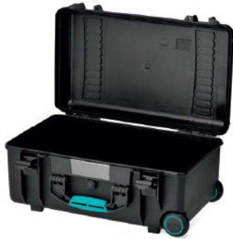
1 EMPTY | EMP