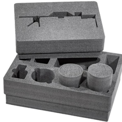
Milled and water cut foam