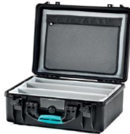
6 SOFT DECK + DIVIDERS | SFD