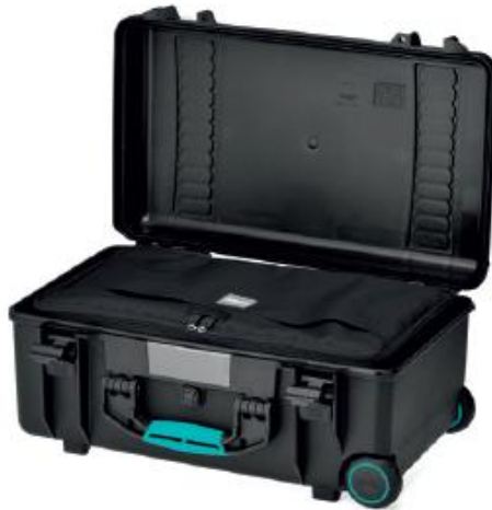
5 INTERIOR BAG | BAG