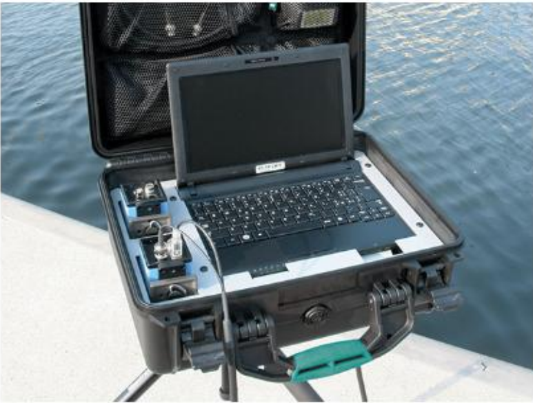
High-tech | Industrial | Electronic