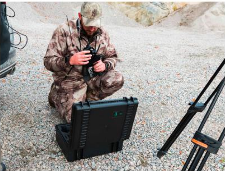
Military | Government police law enforcement