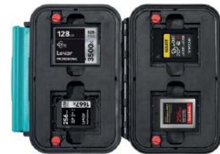
7 MEMORY CARD | CFE/MEM