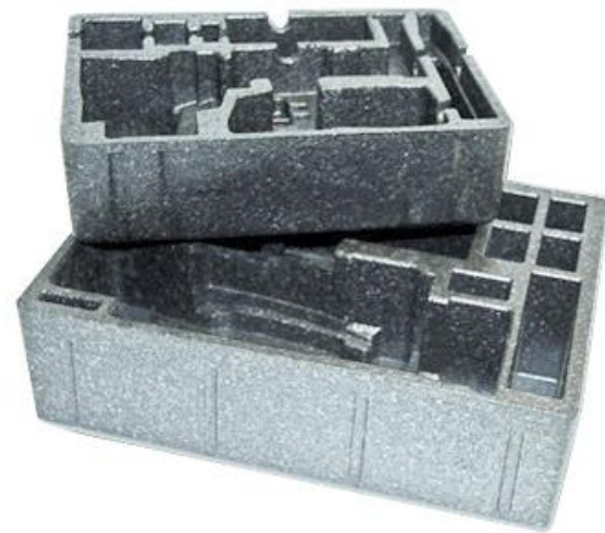
Injection inlays (EPP)