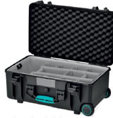
3 SECOND SKIN | SSK