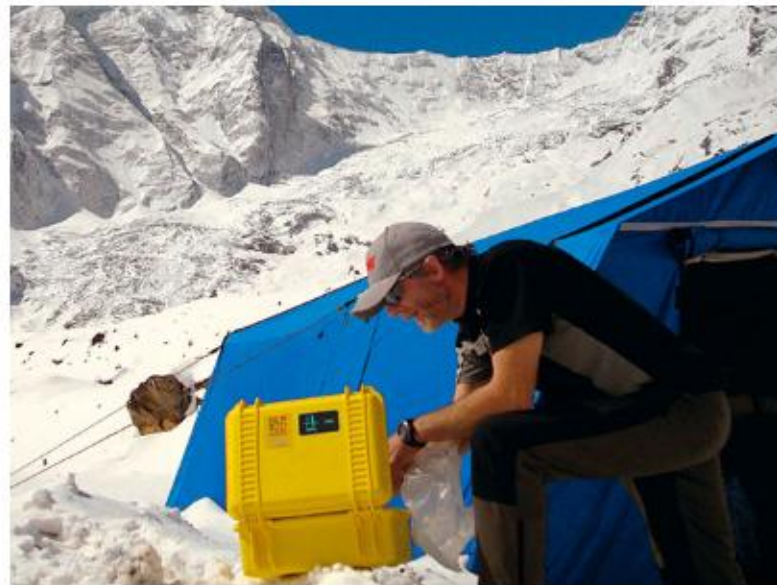
Outdoor | Diving | Marine